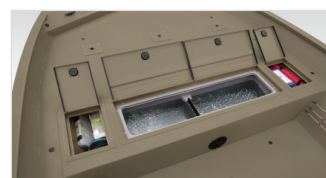
Bow 32-gal. aerated livewell

Photographs may be shown with optional equipment and/or aftermarket accessories.