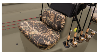
Vertical rod holders